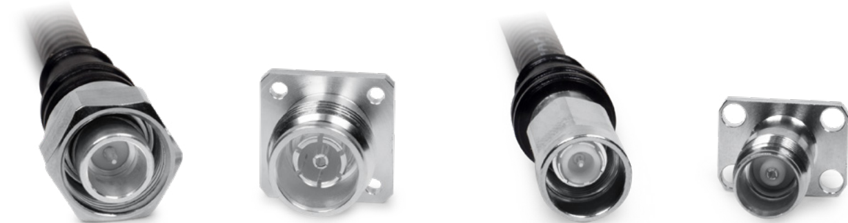
Downsized, but upscale: A comparison of 2.2-5 and NEX10® jumpers with fixed connectors

5G, leading-edge antennas, remote radio units, MIMO and small cells. Both feature a contact bushing that mirrors the fundamental design of 4.3-10. And both come with the seal of quality that is the SPINNER brand.