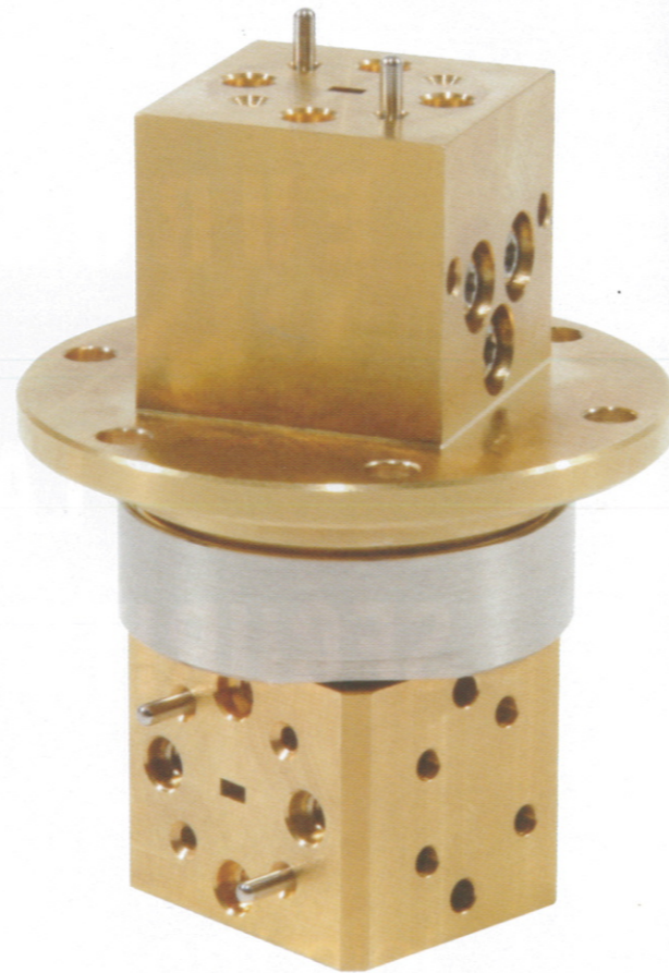
The 94GHz rotary joints will be used to help detect obstacles on roads during severe fogs.

SPINNER's engineers were faced with the complex task of technically implementing the radiofrequency concept. Their aim was to create a broad-band, power-stable and voltage-proof rotary joint that could meet the highest mechanical demands despite being the smallest possible size. Its lifetime of at least 100 million rotations (even under extreme temperatures) and its transferable-pulse peak power of at least 250W are also worth mentioning.